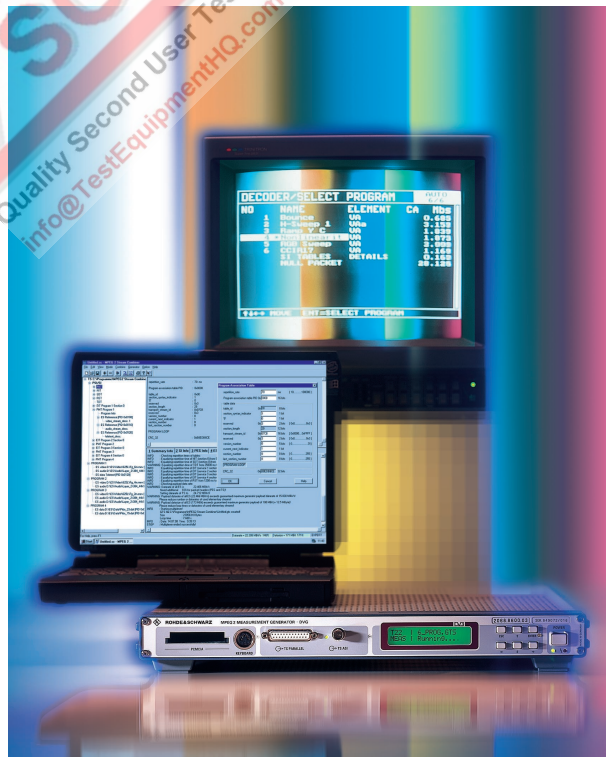
Application-specific transport stream generation with optional PC software Stream Combiner™ DVG-B1

Complementary to Generator DVG, Rohde & Schwarz offers MPEG2 Measurement Decoder DVMD (data sheet PD 757.2744), which is used for real-time monitoring, analyzing and decoding of MPEG2 transport streams.