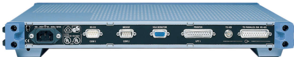
Rear view of DVG

Certified Quality System ISO 9001 DQS REG. NO 1954-04