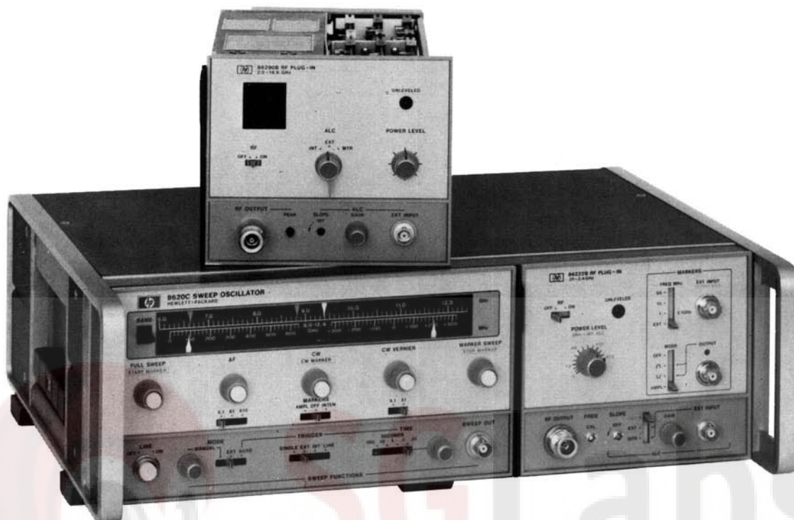
HP 8620C with HP 86222B, 86290B